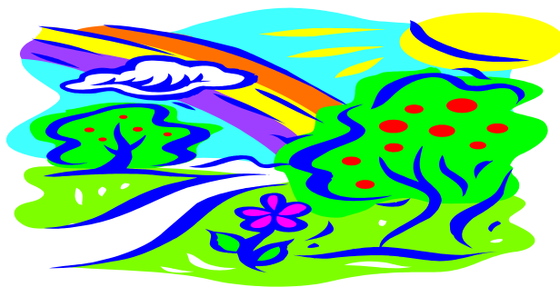
Pathways to Success 2002 Regional Down Syndrome Conference

involved with preschool, school age and transitional age individuals. Topics of interest include guardianship, medical care, teaching math, promotion of inclusion, sign language, the power of the arts, sensory integration, residential programs and the IEP process. Triangle Down Syndrome Network seeks to promote community awareness and acceptance of individuals with Down syndrome. Support and information are provided to families, health-care professionals and educators. Through these efforts, TDSN strives to improve the quality of life for all people with Down syndrome in the Raleigh,