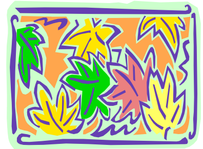
Fall is just around the corner and choked full of exciting and interesting

One additional event to look forward to is the release of the New Parent Book. It will be available very soon!